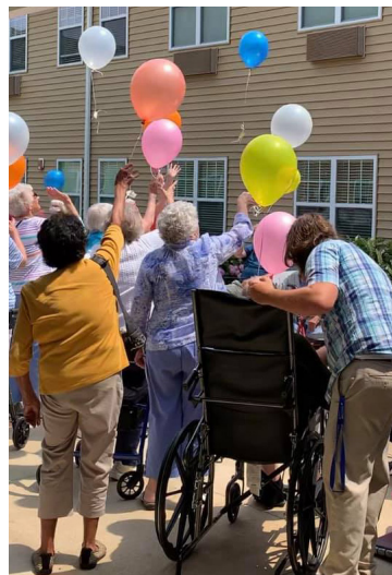
Celebration of Life