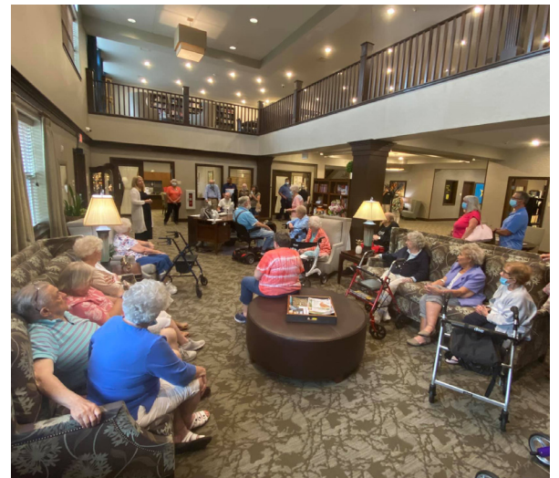
Meet + Greet for all incoming Residents